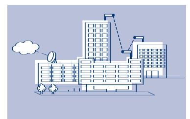
Metropolitan Area Networking